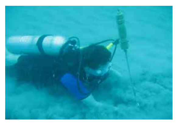
Retrieving a shallow water wave monitor.

UF manages the <u>Florida Coastal Monitoring</u> <u>Program</u>, a research program with the goal of characterizing the intensity and behavior of landfalling hurricanes with direct measurement of wind speed, wind direction, pressure, humidity and temperature at multiple ground level locations(10 meter) in the path of land fall via five portable weather monitoring platforms. TTU, LSU, and Clemson University also participate in this project and provide additional portable monitoring assets. Much of the data are relayed in real time to a public access website and via direct push to researchers in NOAA's Hurricane Research Division.