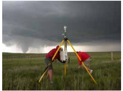
Data observed using the Texas Tech StickNet system for wind, rain, relative humidity, and barometric pressure can be used in damage assessments.

AAWE was originally established as the Wind Engineering Research Council in 1966 to promote and disseminate