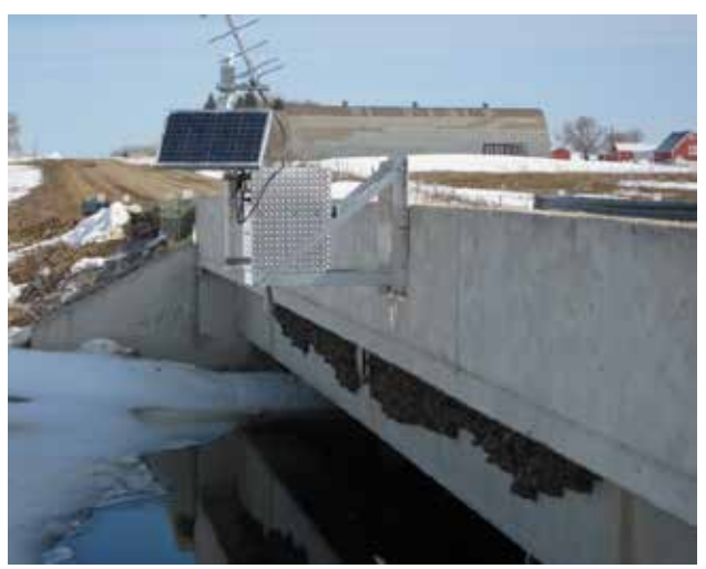
The USGS has developed new rapidly deployable, mobile streamgages to provide short-term water-level data to critical areas lacking permanent streamgages.

Shoreline Change. Through the Coastal and Marine Geology Program, the USGS Geologic Division investigates the geologic impacts of extreme storms and hurricanes on the physical coastal environment. A major objective of these investigations is to improve the capability to